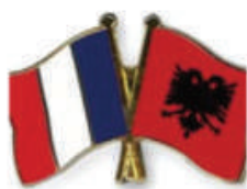
Maison de l'Albanie- Paris

Connaître l'Albanie à travers son Art et sa Littérature Njihuni me Shqipërinë përmes artit dhe letërsisë së saj