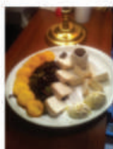
Le Saint Mathias